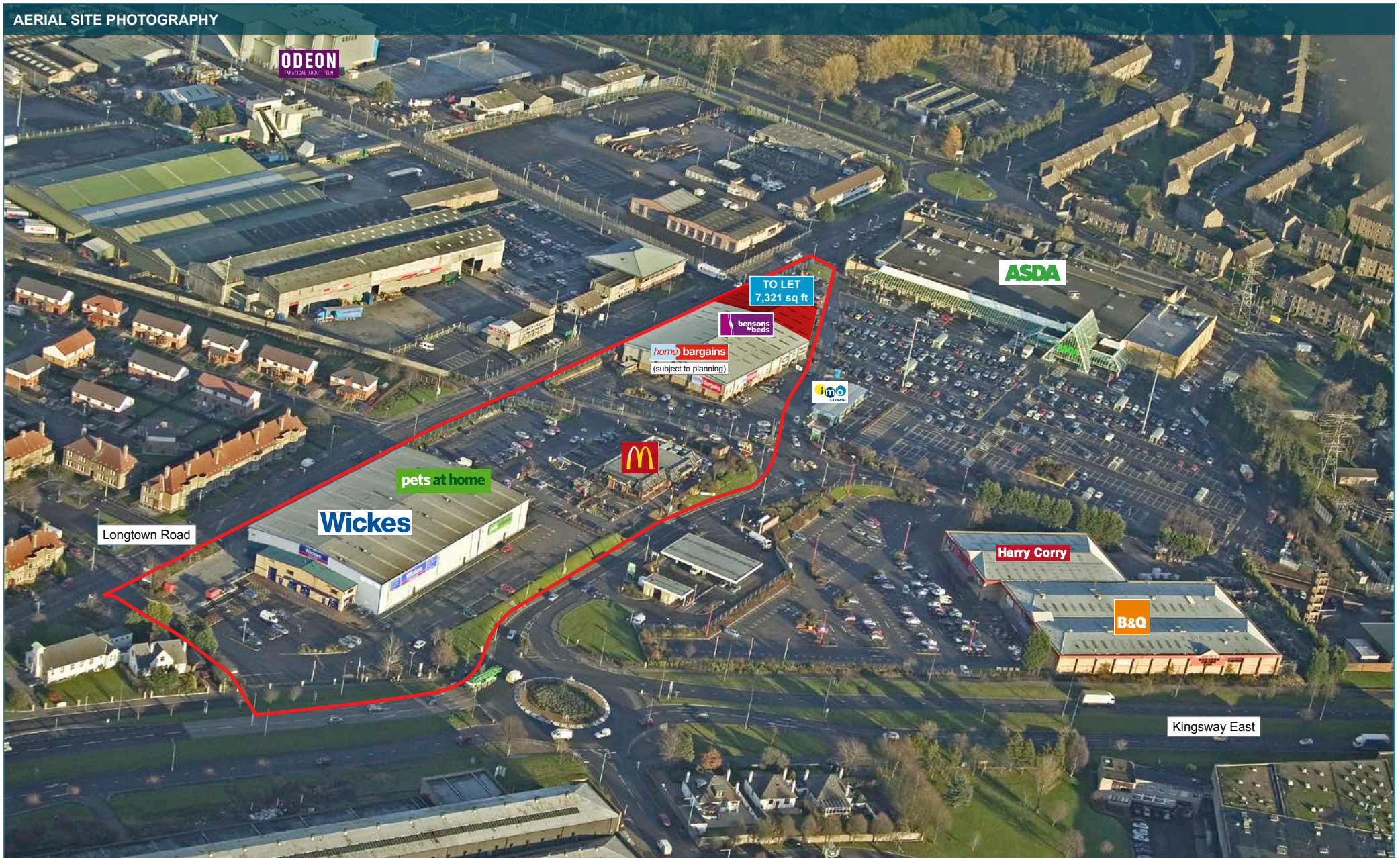
AERIAL SITE PHOTOGRAPHY